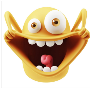
Overly Excited Jittery & Scattered

Our friends at Look for the Good Project have helped us identify four challenging emotions that students may experience on Field Day: