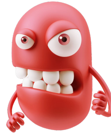
Frustrated Angry & Disappointed