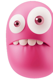
Embarrassed Want to Run & Hide

Think of these emotions as little friends who have come to visit. Set up a Charging Station for students to make friends with these emotions and use their energy to get focused, motivated, courageous and resilient.