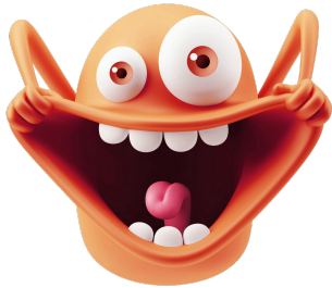
Overly Excited Jittery & Scattered

Our friends at Look for the Good Project have helped us identify four challenging emotions that students may experience on Field Day: