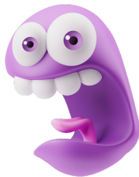
Worried Afraid & Jumpy