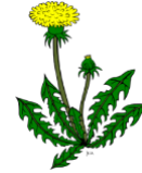
Weed or Flower